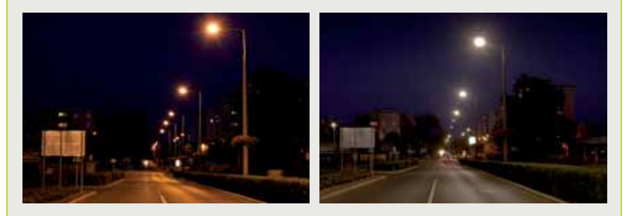
Figure 3: Kaszap Road, replacement of HPS by LED

In 2010 and 2011 more than 6,000 new LED street lighting luminaires were installed in the city of Hódmezővásárhely. The energy savings achieved are 35% and the new lighting solution is nearly maintenance free. Through the new SSL solution the lighting levels and the overall visual comfort and feeling of safety have been significantly increased.