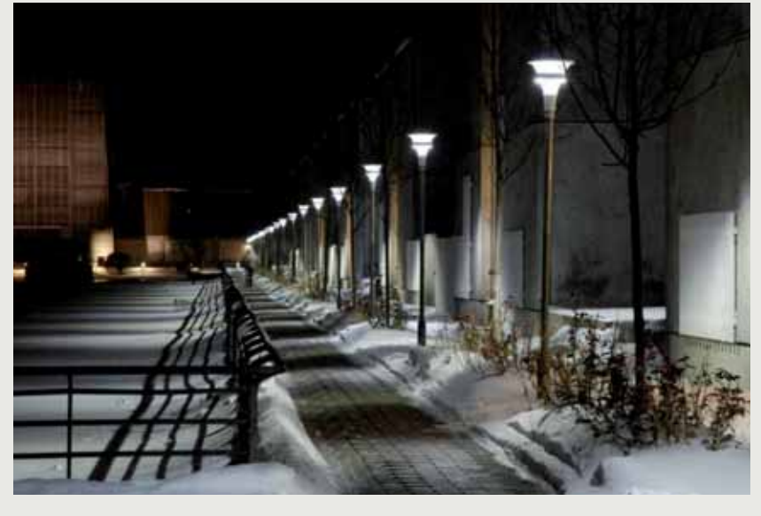
Figure 7: Albertslund street lighting

The municipality of Albertslund, located in the wider Copenhagen area, has adopted a new lighting plan which is solely based on LED technology. The plan includes the development and testing of different street lighting designs and Wi-Fi based smart control systems. In recent years, the town has contributed to the invention of several outdoor lamps, in close cooperation with designers and manufacturers; noteworthy is the award winning "A-lamp". Today, the first stage of a "Scandinavian Lighting and Photonics Science Park" is under development in Albertslund, with the 'Danish Outdoor Lighting Lab' (DOLL) as the driving force. Copenhagen, the European Green Capital 2014, will invest € 40 million to replace 21,000 street and traffic lights with SSL by 2015.