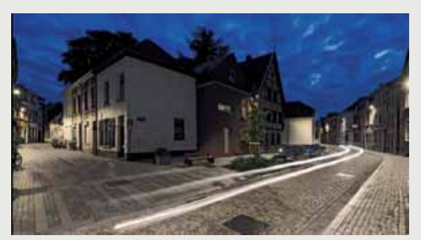
Figure 4: Mechelen's street lighting

installed system is futureproof and can easily be upgraded to keep pace with the rapid evolution of LED technology, which will permit additional energy savings. The project was implemented by the Flemish regional electricity distribution network operator Eandis.