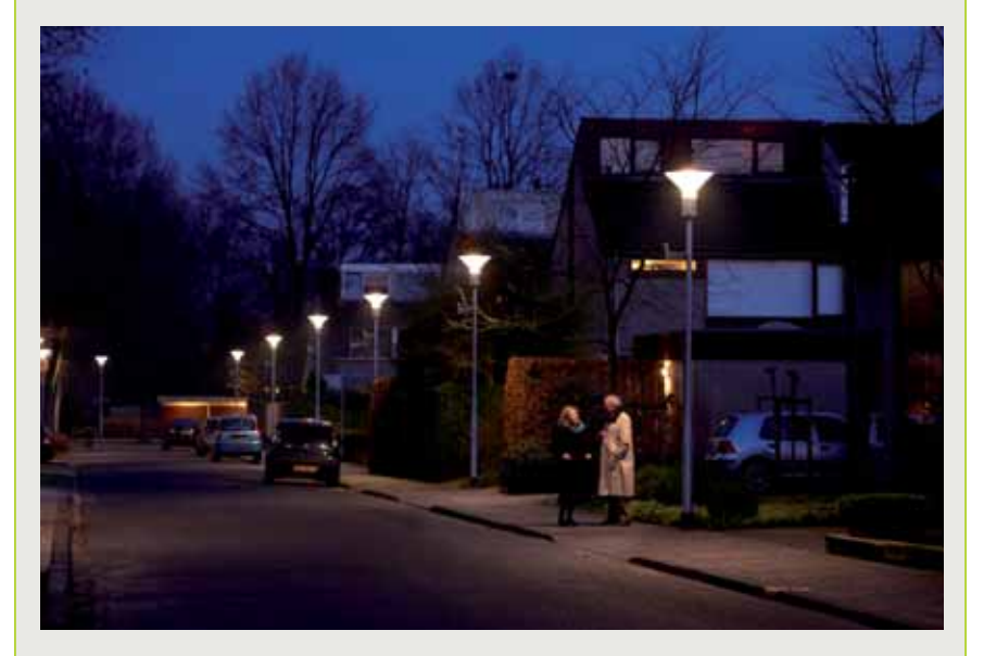
Figure 6: New LED lighting in Tilburg