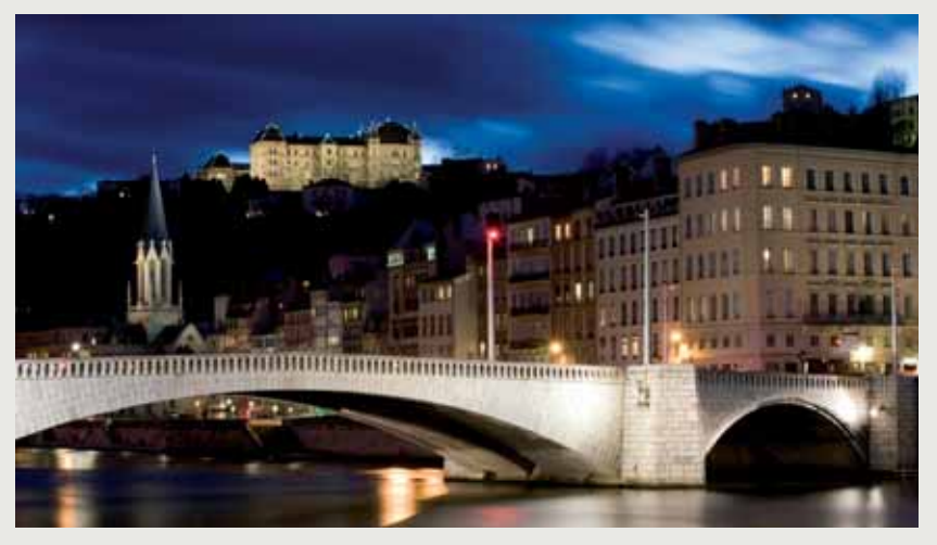
Figure 5: Lyon city centre<sup>24</sup>